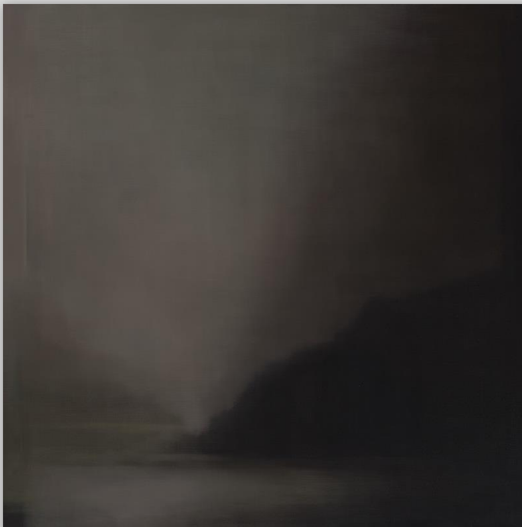
Marshes 2021 oil on linen, 120x120cm $ 11,000 (framed)