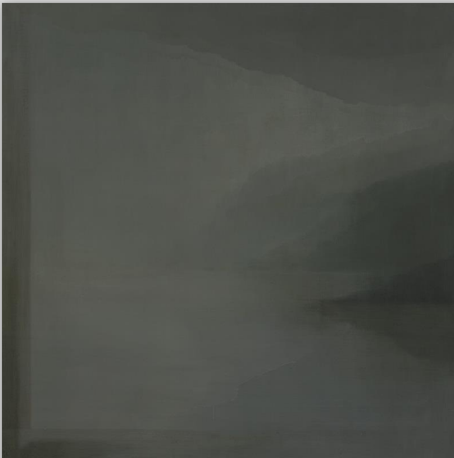
Fret 2021 oil on linen, 91x91cm $ 8,800 (framed)