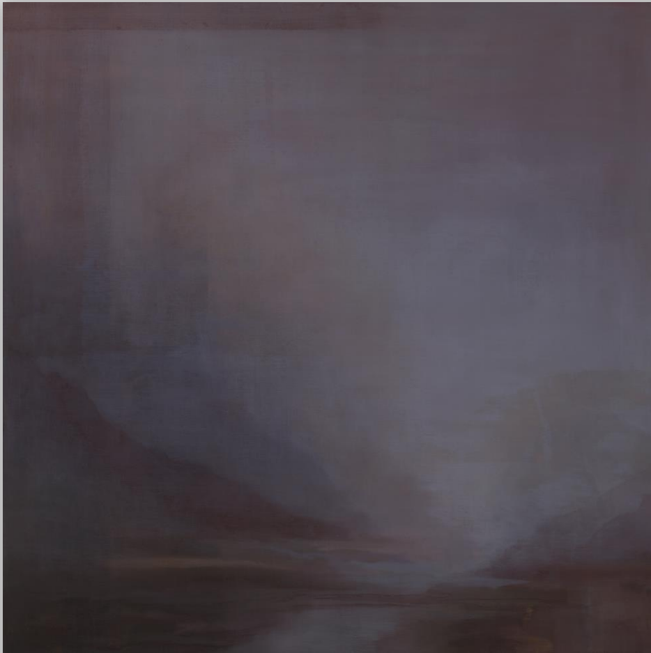
Shift Recall 2021 oil on linen, 91x91cm $ 8,800 (framed)