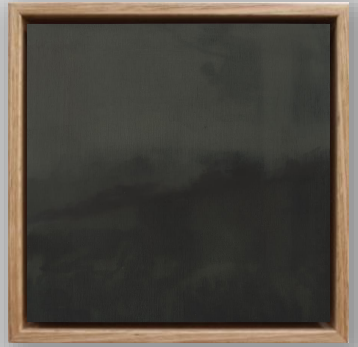
Night Garden 2021 oil on board, 30x30cm $ 2,200 (framed)