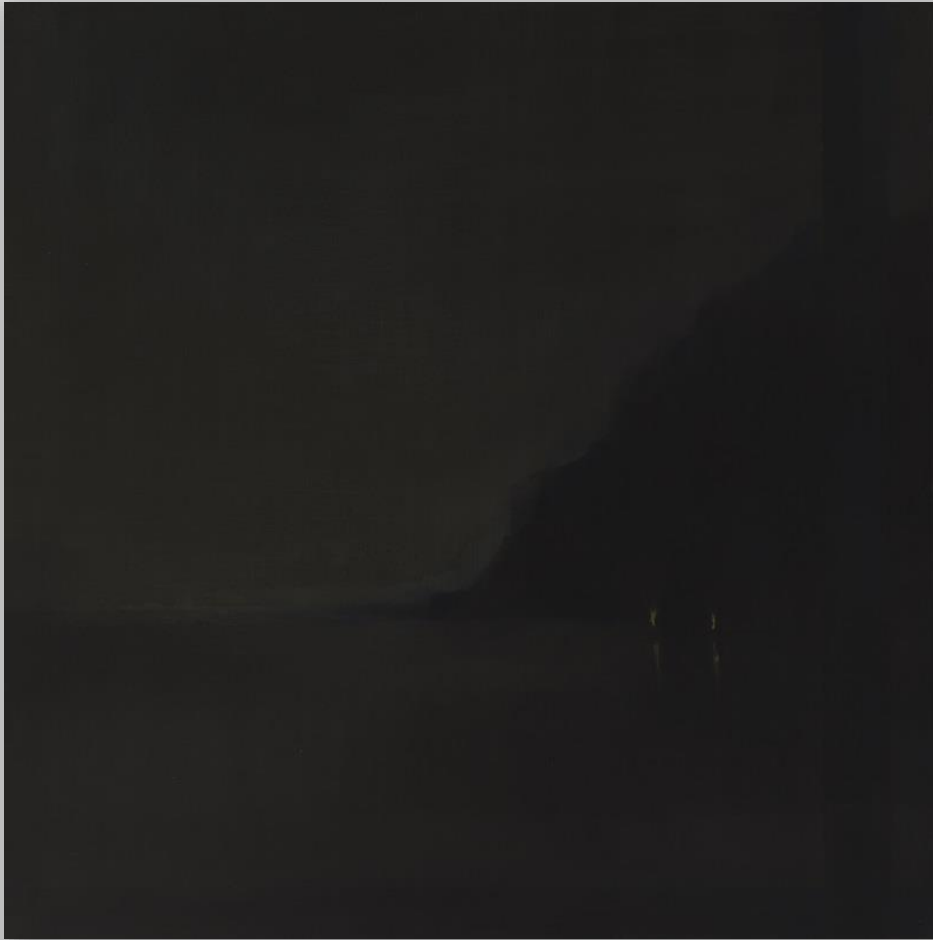
Smugglers Cave 2021 oil on linen, 91x91cm $ 8,800 (framed)