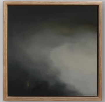
Moon 2021 oil on linen on board, 20x20cm $ 1,650 (framed)