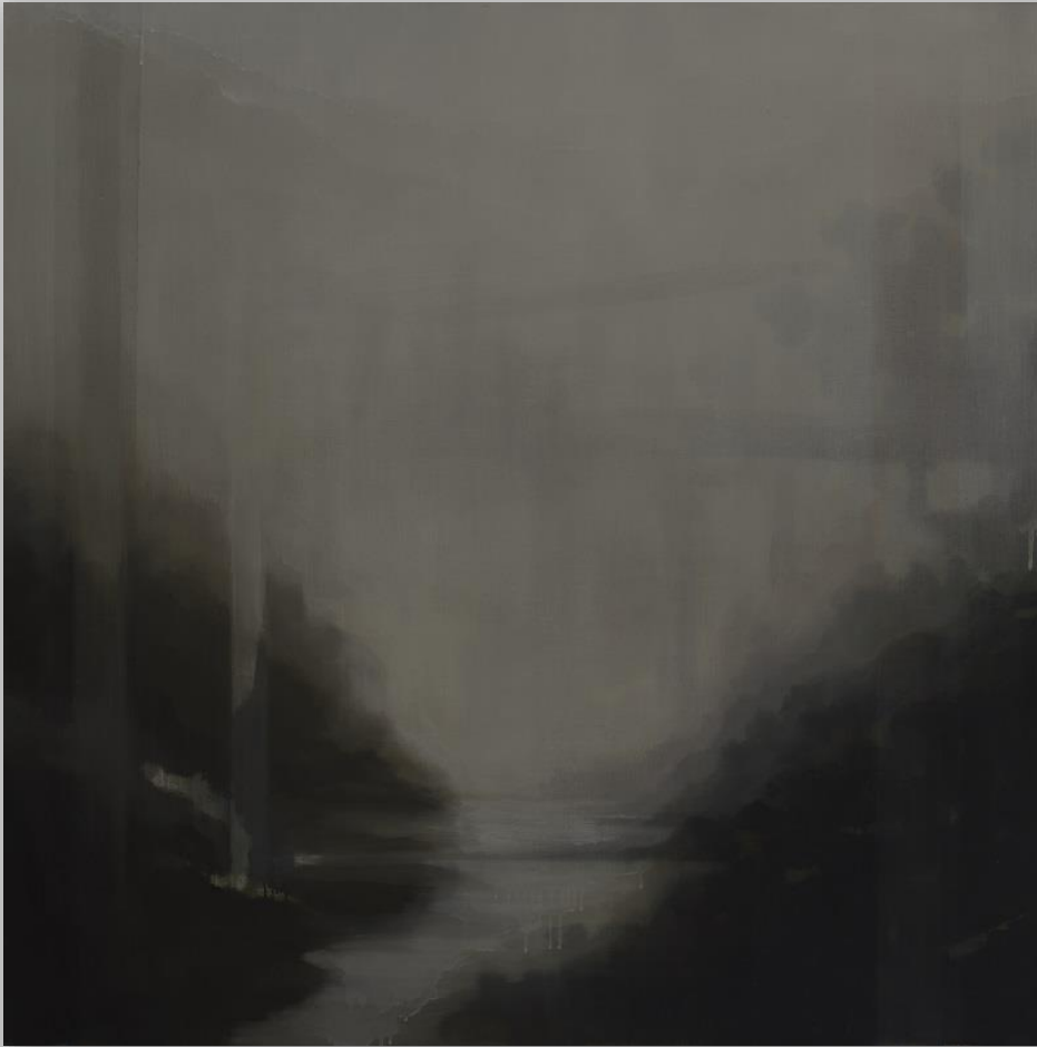
Arcadia 2021 oil on linen, 91x91cm $ 8,800 (framed)