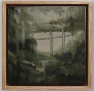
Ruin 2021 oil on board, 30x30cm $ 2,200 (framed)