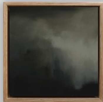
Tor 2021 oil on linen on board 20x20cm $ 1,650 (framed)