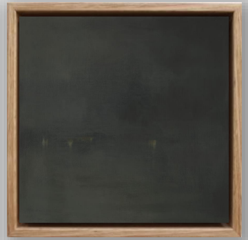
Nocturn II 2021 oil on board, 30x30cm $ 2,200 (framed)