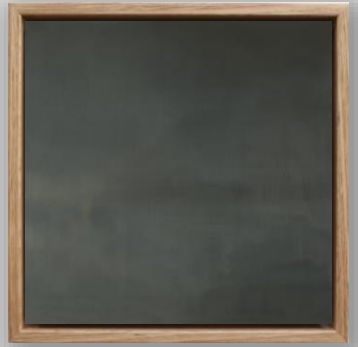
Nocturn I 2021 oil on board, 30x30cm $ 2,200 (framed)