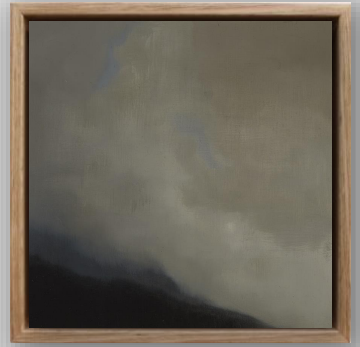
Loom 2021 oil on linen on board, 20x20cm $ 1,650 (framed)