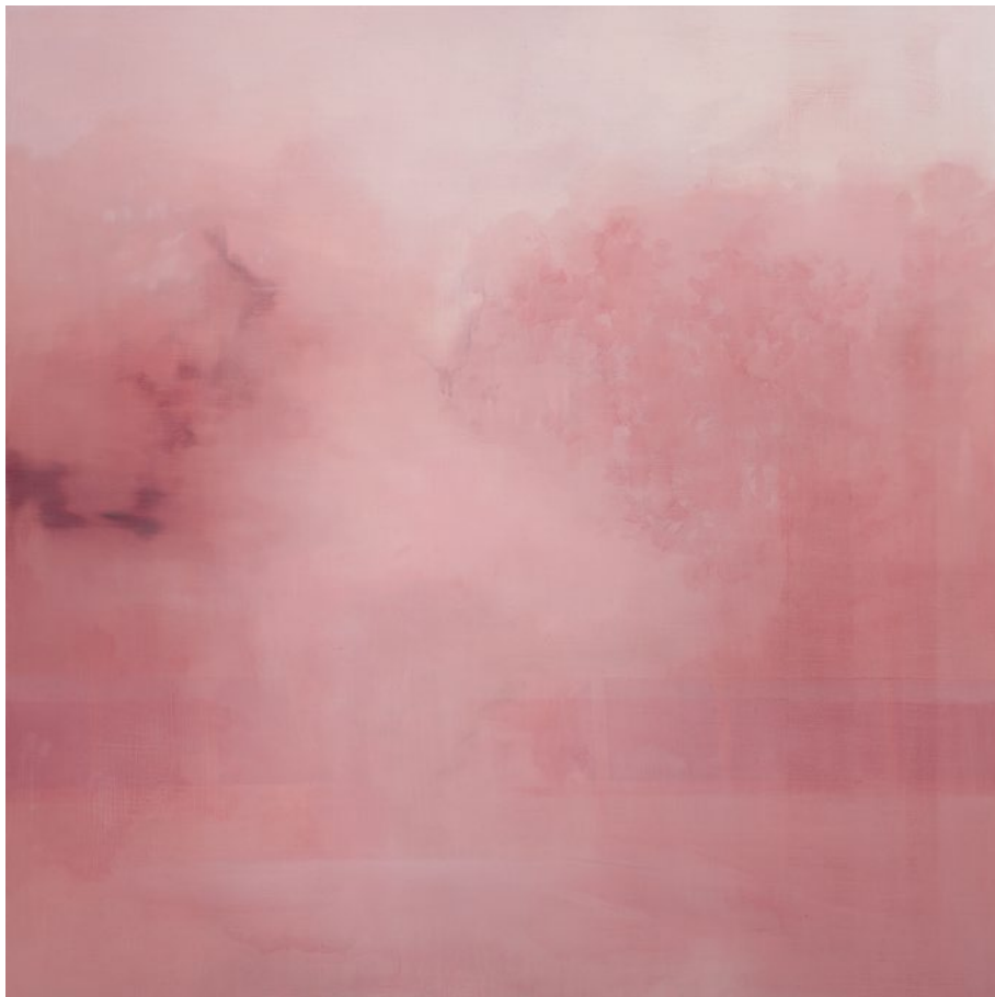
Division 2017, 91 x 91 cm, oil/wax on linen