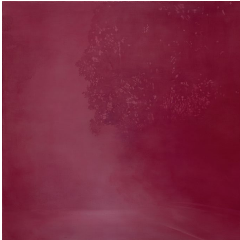
Displacement 2015, 91 x 91 cm, oil/wax on linen