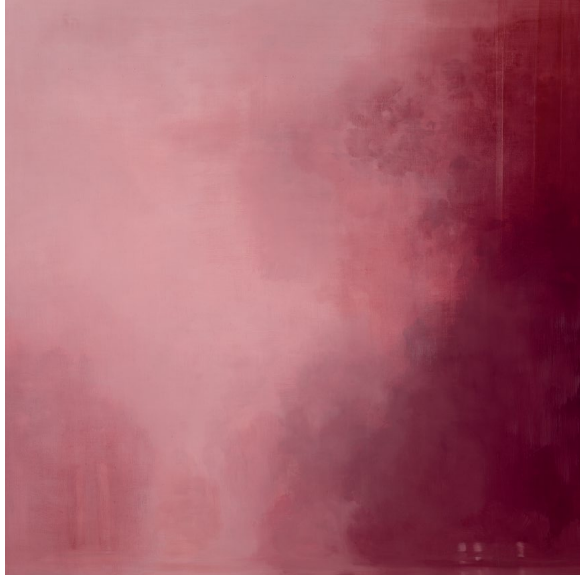
Daybreak 2017, 91 x 91 cm, oil/wax on linen