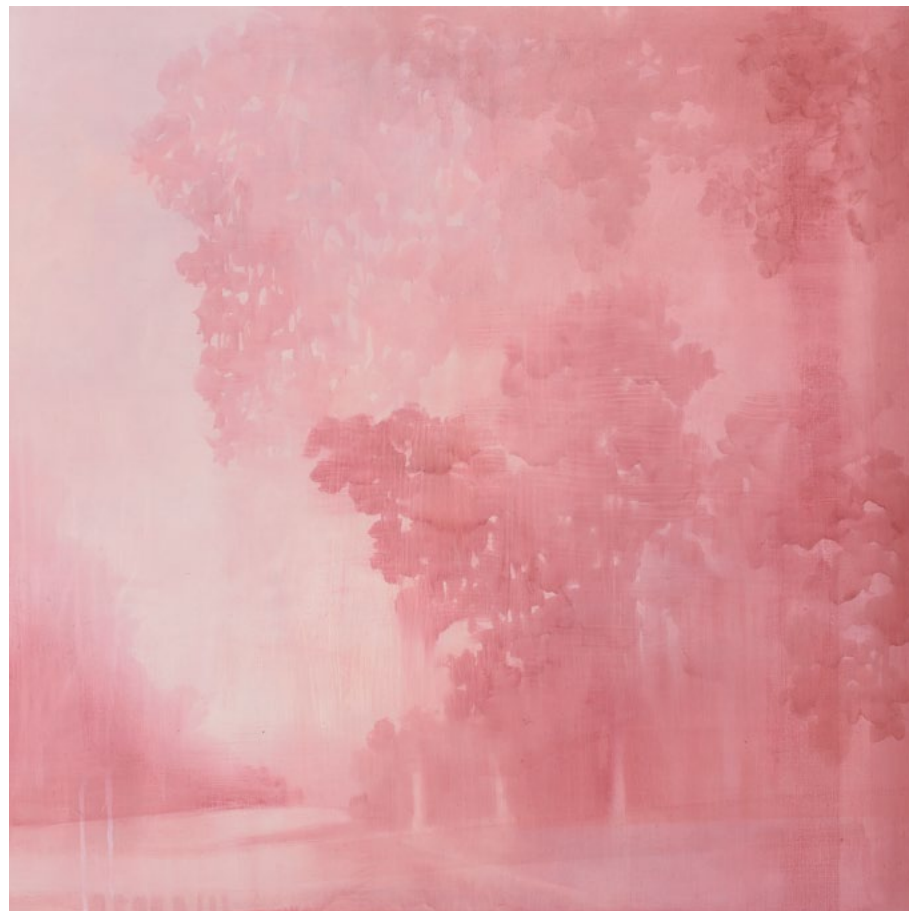
Diversion 2017, 91 x 91 cm, oil/wax on linen