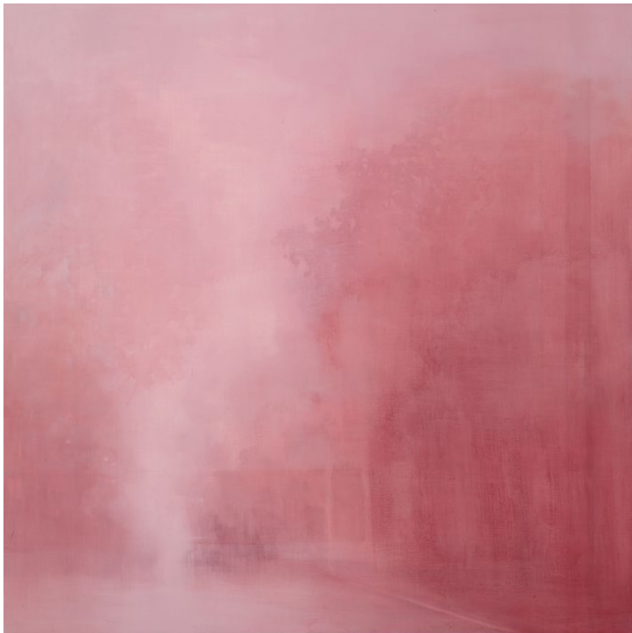
Disruption 2017, 91 x 91 cm, oil/wax on linen