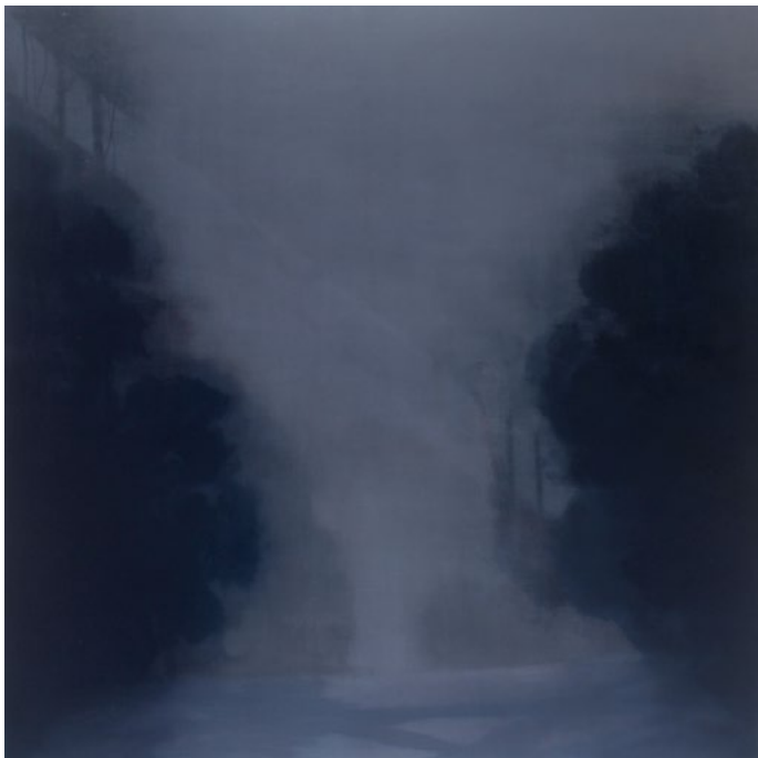
Approach 2015, 91 x 91 cm, oil/wax on linen