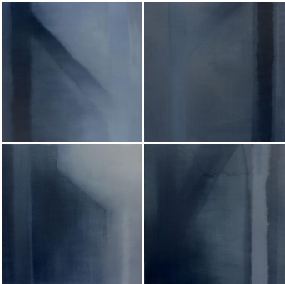
Haefliger's Conversation 2016, four panels 51 x 51 cm, oil/wax on linen