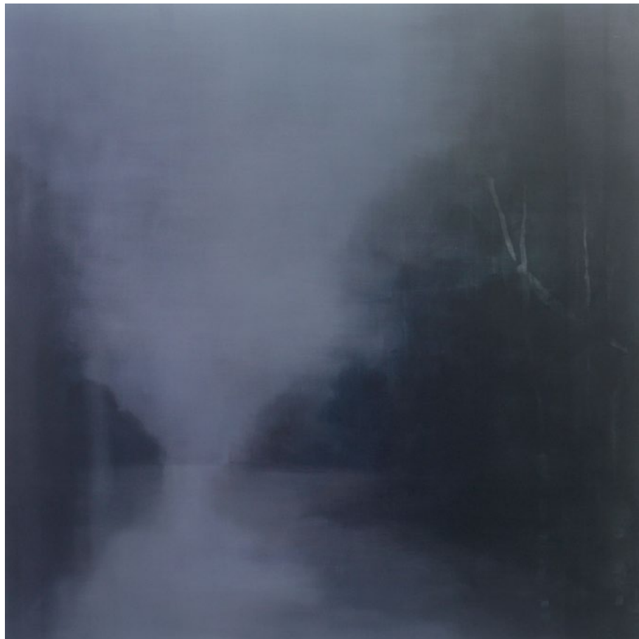
Cable 2015, 122 x 122 cm, oil/wax on linen