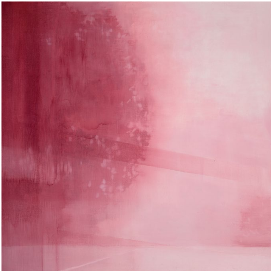
Dissolve 2017, 91 x 91 cm, oil/wax on linen