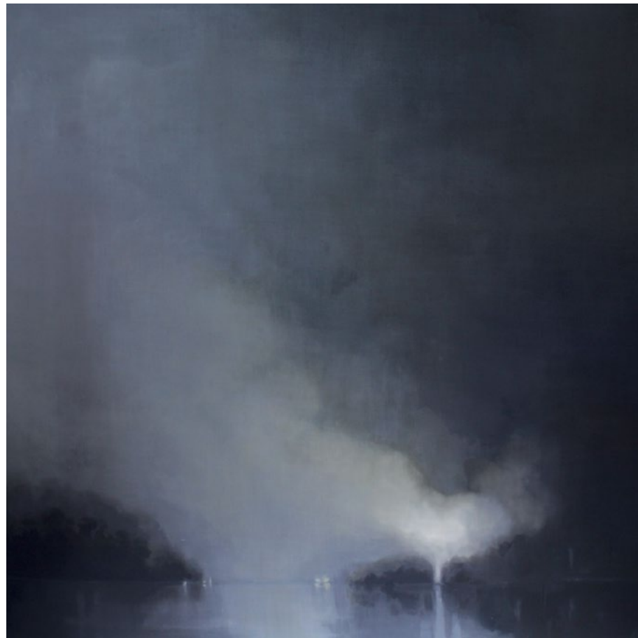
Disquiet 2016, 152 x 152 cm, oil/wax on linen